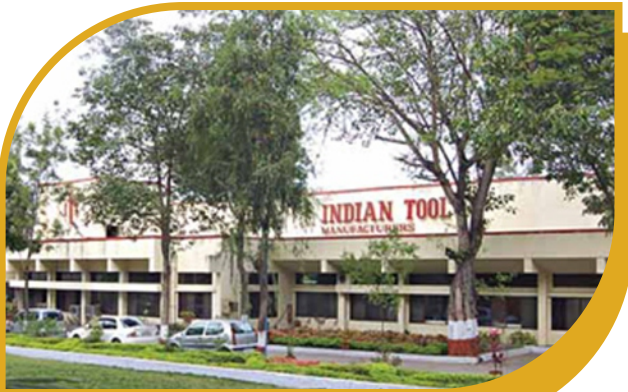
ITM NASHIK UNIT NO. 1