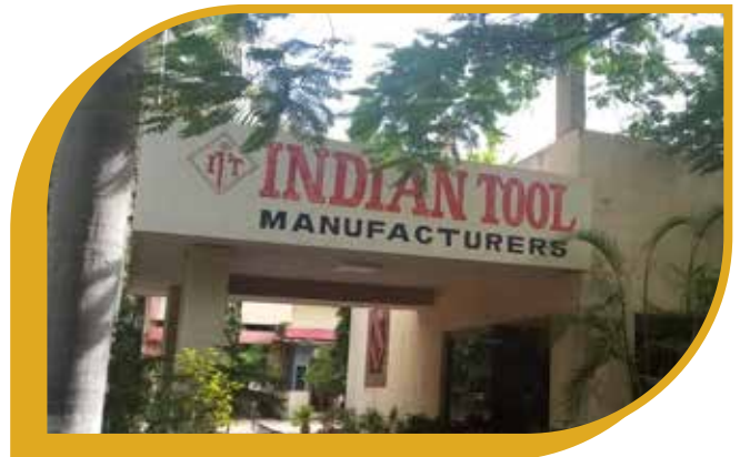
ITM AURANGABAD UNIT NO. 2