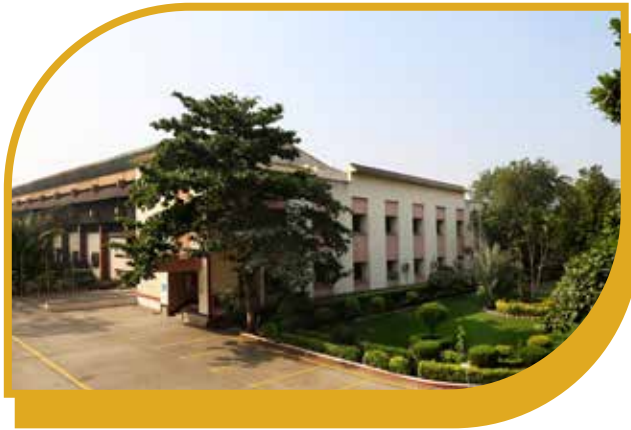
FOUNDRY DIVISION AURANGABAD