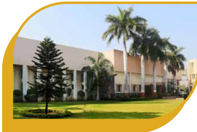
TOOL HOLDERS DIVISION AURANGABAD